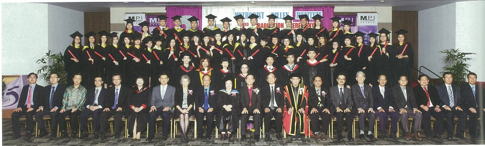
Our 3 rd Batch of Degree Graduates in Accounting and Marketing