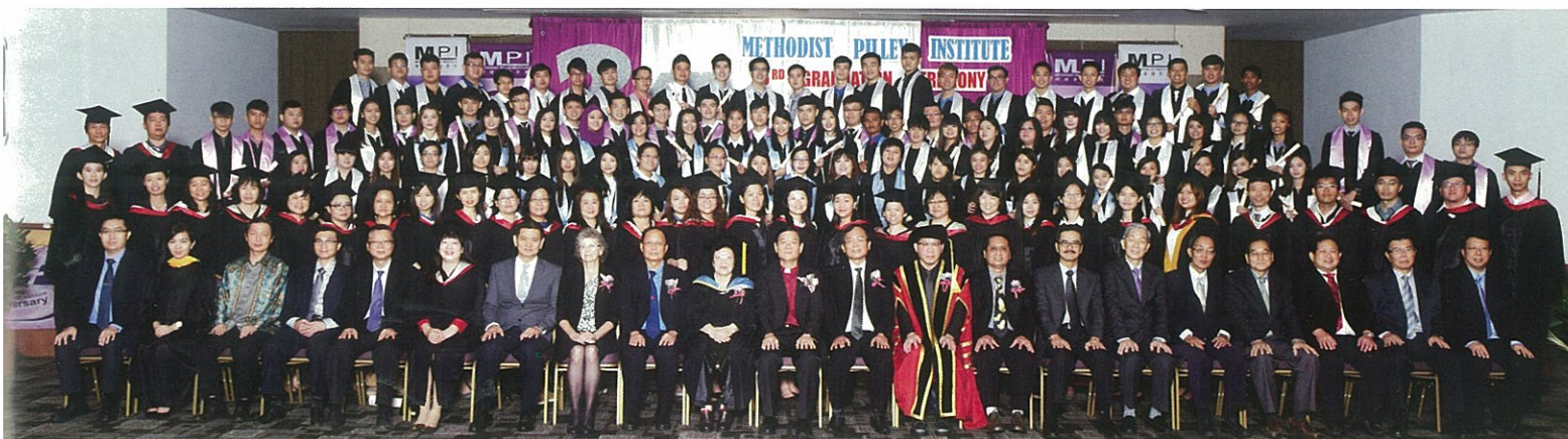
Our Diploma Business Management, Computer Science and Early Childhood Education Graduates.