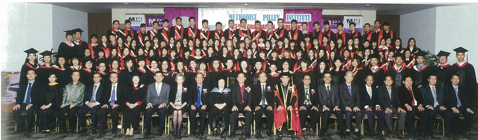
Our Diploma Accounting Graduates